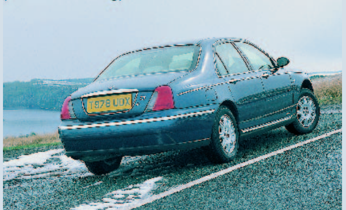
Tuning Box considerably changes power delivery characteristics