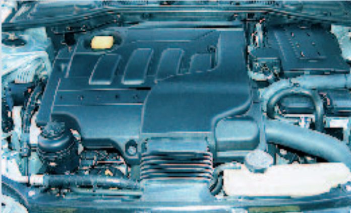
BMW-sourced turbodiesel is a little underpowered in the Rover 75