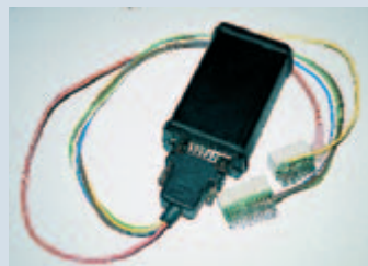
Bromley's discreet modification is effected in a matter of minutes

(ECU). Two cables from the Tuning Box terminate in multi-pin adaptors and are inserted into the standard wiring loom, while the 3 x 2 x 1-inch unit is clipped neatly into place nearby. Finally another single lead is plugged in to provide the 12-volt power source. And that's it. As soon as the trim was popped back into place we were off to see what the dynamometer figures would reveal.