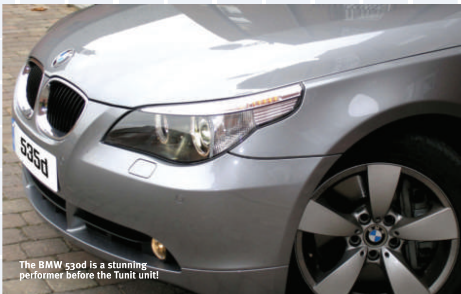
The BMW 530d is a stunning performer before the Tunit unit!

the serious business was about to begin! The first run registered 293bhp and two swift adjustments to the Tunit saw this rising to 326bhp, with the calculated torque figure a massive 480 lb ft. Another couple of runs to confirm the figures, left the Tunit technicians more than happy with their achievements. They knew that maybe more was there for the asking, but were quite satisfied that this level of improvement would put a wide grin on the face of the BMW's owner. Like Oliver Twist, he could always ask for more, and would probably not be refused! The whole tuning process was very swift – as much down to the brevity of the full-power acceleration runs as the speed and ease with which the tweaks to the adjustable Tunit conversion were made. I've never seen the power trace move quite as quickly on the VDU screen as with this modified 535d! Neither had I seen the registered speed top