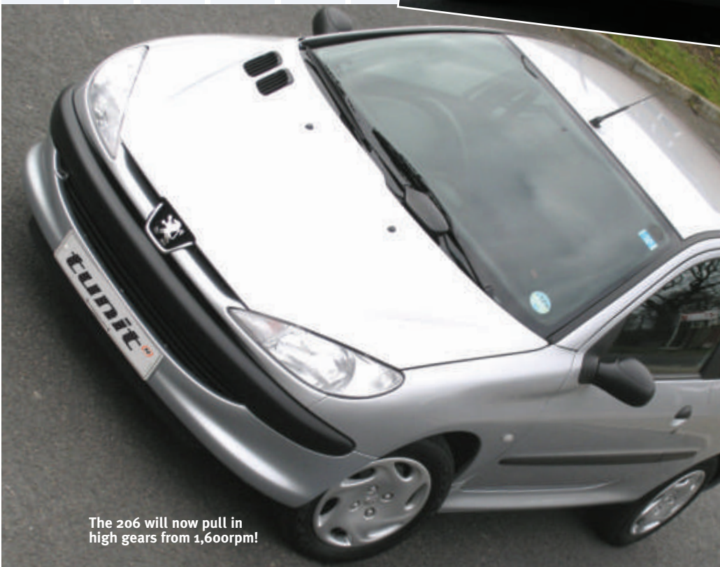
The 206 will now pull in high gears from 1,600rpm!

when the torque is boosted in this area it gives direct benefits in fuel consumption. The biggest power gains percentage-wise are from 2,500-3,500rpm and, as I found out on the road, an extra 10bhp means that there's also a lot sharper performance on hand, along with that vastly improved flexibility. OK, it's no hot hatch, but the Tunit conversion transforms the 206 from being a little bit flat and boring into a zippy little machine that's quite fun, and more economical. And this Tunit conversion would do exactly the same for any similarly powered Fiesta, or Citroën C2 or C3, along with a huge range of conversions individually developed for all popular diesel engines. For details of all such Tunit conversions find their web site at www.tunit.com or call them on 01257 274100 where one of their team of technical sales advisors will discuss your car and exactly what a Tunit conversion can do for it – be it more power, torque, of better economy that is your target. ■