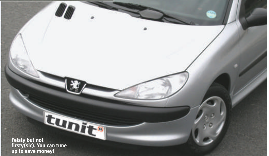
Feisty but not firstly(sic). You can tune up to save money!

maximum fuel economy from his fleet. He includes his own car in this brief and, after reading up and researching electronic diesel engine tuning, he concluded that there were pretty good prospects of significant economy gains from having the 1.4 HDi engine tuned – in this case as much for better torque and economy as for any pure performance gains. So he took it to Tunit HQ at Chorley a few weeks ago and has already proved his theories to be correct – for example he is now recording an average of 70mpg instead of the previous 65mpg – an increase that's just short of eight per cent! I was there at Tunit when Stuart's car returned for a follow-up run on the rolling road dynamometer, and possibly a small tweak to the existing settings of the Tunit.